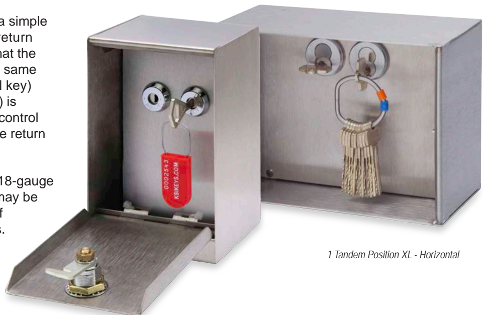
1 Tandem Position XL - Horizontal

Chit Key Vaults™ come in two sizes of 18-gauge brushed stainless steel. These vaults may be customized to any size with a variety of lock options to meet your requirements.